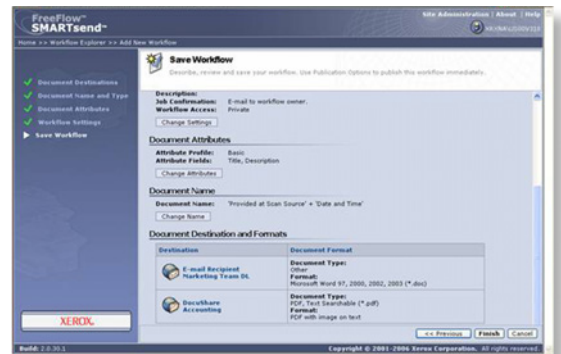
Wizards intuitively guide users through every step of the workflow